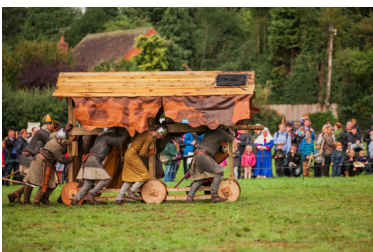
A battering ram being pushed by siege re-enactors.