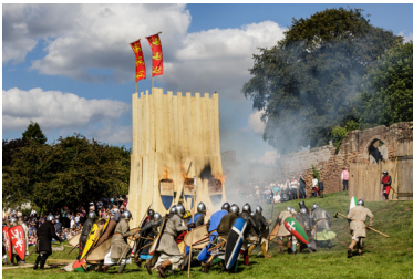
A siege tower being pushed towards a curtain wall during a siege re-enactment.